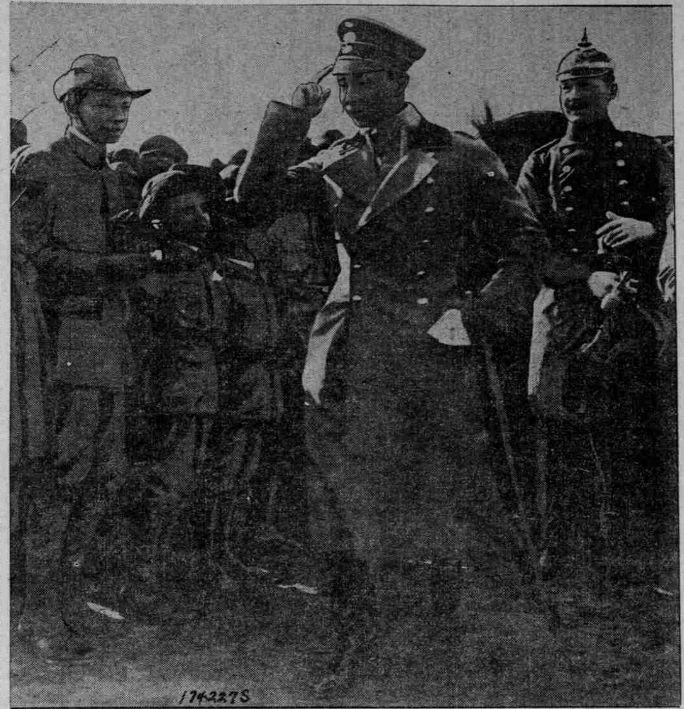
FREDERICK WILLIAM OF GERMANY AT GIUENEWALD JUST BEFORE OUTBREAK OF WAR.