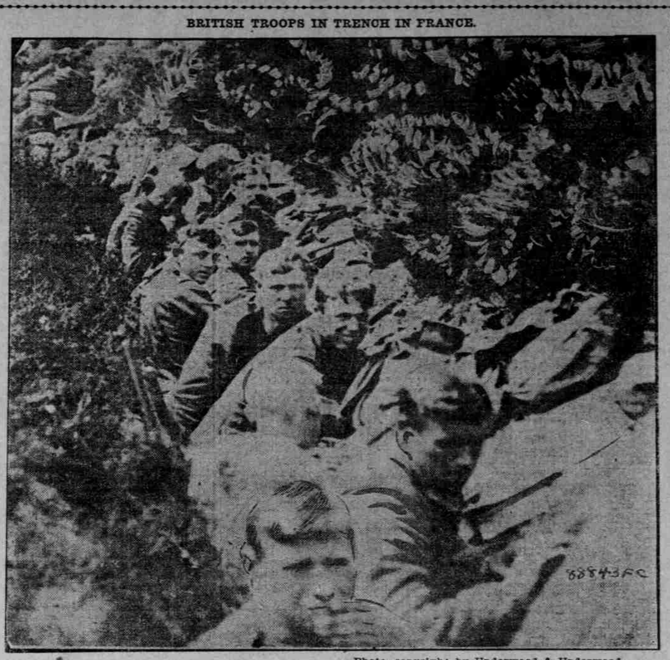
PHOTOGRAPH SHOWS NATURE OF COUNTRY IN WHICH THEY ARE FIGHTING.

Rheims Structure Famous as Place of Crowning of Kings. If the reported destruction of the Cathedral of Rheims is true, it is the greatest loss from an historical and artistic sense of the present war.