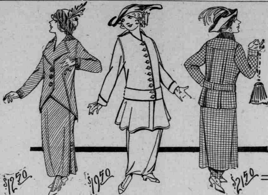
Sizes 15, 16, 17, 18 and 19 Years

Our buyers, while in the markets, made a special point of procuring the most up-to-date, youthfully-designed and varied collection of Tailored Suits for Misses and Juniors it was possible to secure. In consequence of this vigilance we are able to offer our patrons one of the most comprehensive assortments ever grouped together in any one store to select from. Youthfulness of line distinguishes every Suit in this collection—every style being suited to the age it is designed for, and thus vastly becoming. And the variety from which you may choose is so great that all tastes may be gratified. These Suits are especially desirable for school wear, and high school girls who would be properly clothed will find their model in this group of Suits.