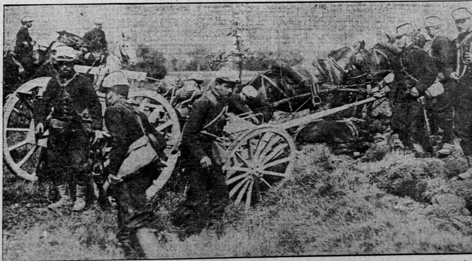
FRENCH ARTILLERYMEN IN CHARGE OF GUN STRIKE SNAG WHILE MANEUVERING FOR POSITION. NOTE THE FALLEN HORSE.