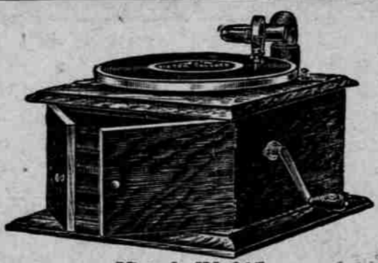
Victrola IV, $15 Oak

Senator Poindexter, of Washington, wanted the original allotment of $500,000 for the Spokane section restored. Representative Clark, of Florida, asked for an increase in the allotment to Florida banks increased.