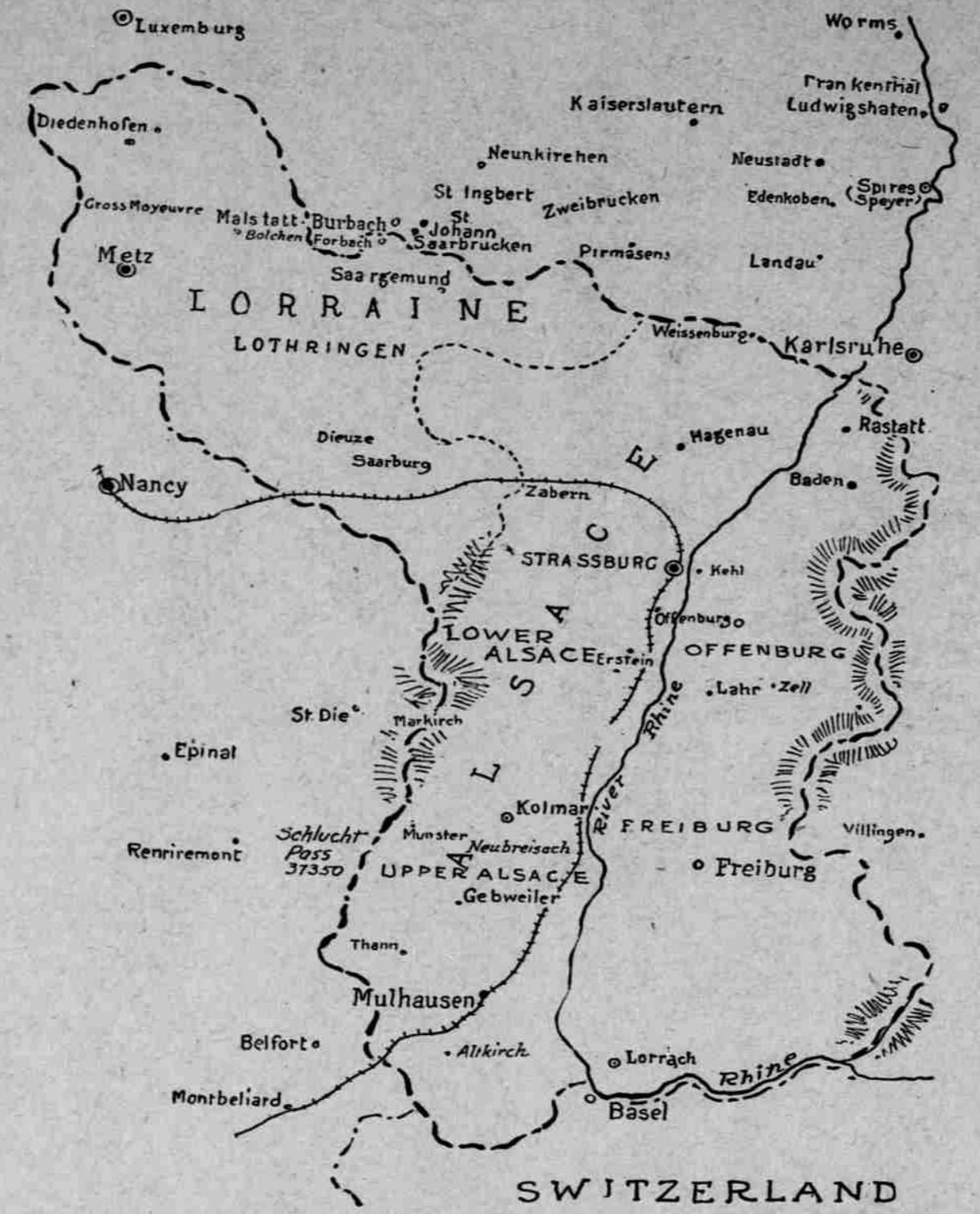
MAP SHOWING VITAL FRONTIER TERRITORY BETWEEN FRANCE AND GERMANY WHICH HAS BEEN SCENE OF DETERMINED FRANCO-GERMAN CONFLICT IN PRESENT WAR AND IN BITTER WAR OF 1870.

ALSACE AND LORRAINE, GERMAN-RULED TERRITORY, STRONGLY FRENCH IN SENTIMENT, WHICH HAS BEEN THE OBJECTIVE OF THE FIRST OFFENSIVE MOVEMENTS OF THE FRENCH ARMY AGAINST GERMANY. The French have concentrated much of their energy to destroying the outposts of the Germans in Alsace and have taken, among other towns, Mulhausen, an industrial center and seat of an airplane factory; Altkirch, a comparatively well fortified town, strongly French in sentiment, and Kolmar, which has been reported unofficially as having been occupied by the French. The French have hurled large detachments against the Germans, who were scattered throughout Alsace, and while the occupation by the French of these towns is not viewed as vital, it has given them a foothold in a rich and resourceful, as well as comparatively friendly country. So far as the news indicates, the Germans are expecting to make their most determined stand in Alsatian territory around Strassburg, which is on the edge of Alsace. Little actual fighting has occurred in the Lorraine division, this ground being used presumably by the Germans for concentrating their forces.