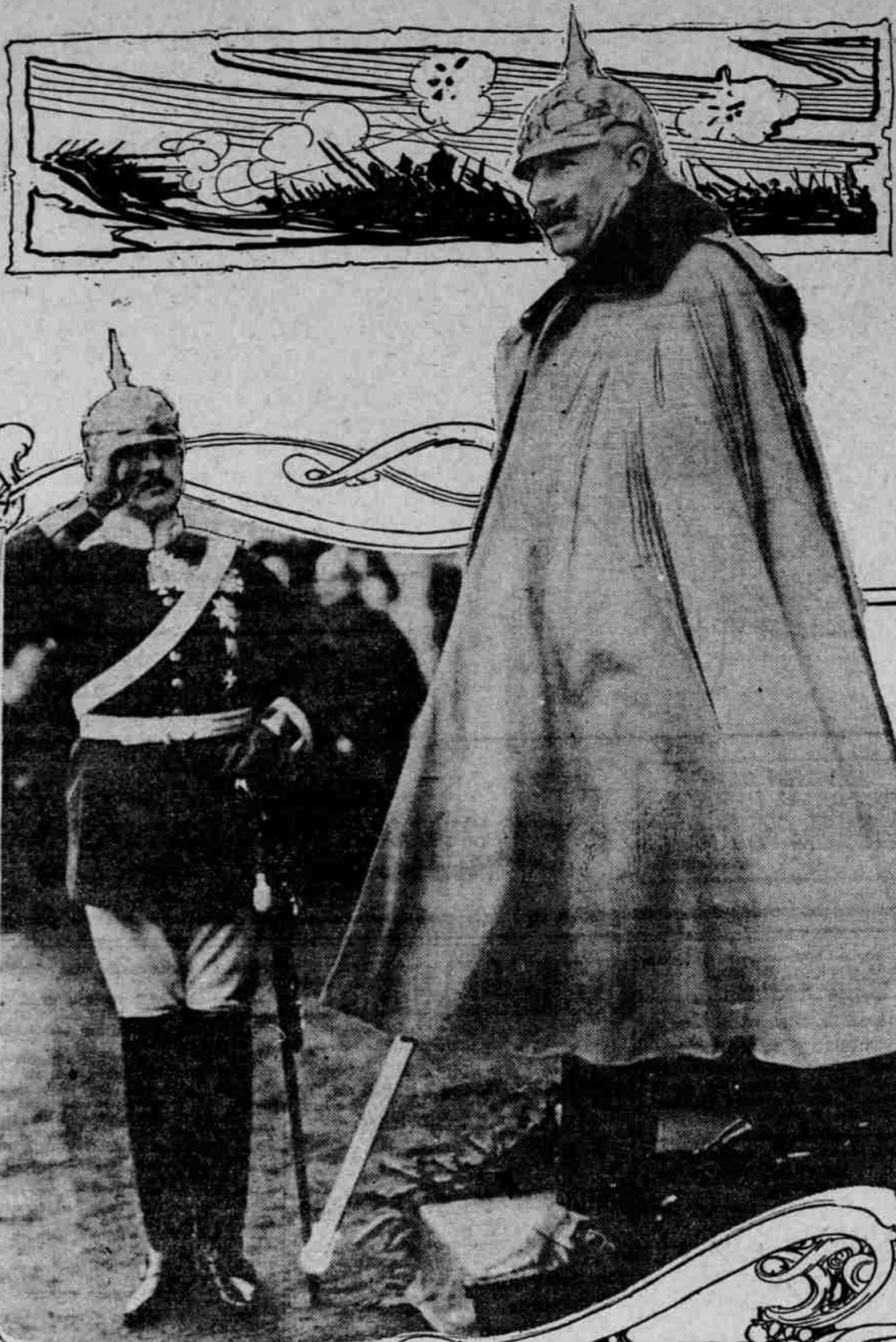
KAISER WILLIAM LEAVING PALACE TO REVIEW GERMAN TROOPS.