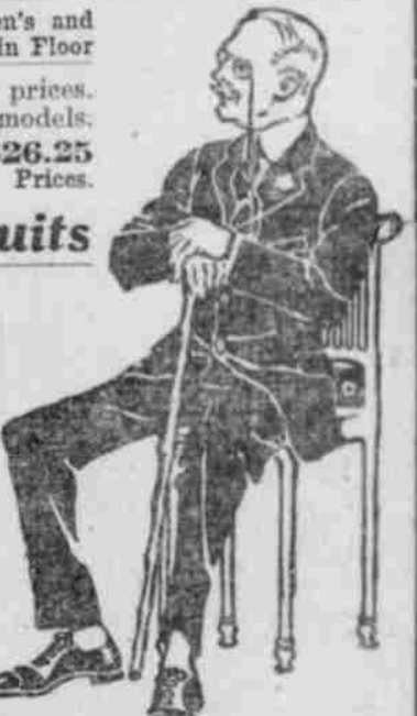
Double Stamps Today With Cash Purchases in Men's and Boys' Apparel.

Main Floor—Boys' "Oliver Twist" Wash Suits of galatea, chambray and madras. Plain white, white waist with blue pants, blue and white stripe effects. All full cut styles, nicely made. Ages 2 1/2 to 7 years. Regular $1.50 Shirts on sale at 98c Boys' Russian Wash Suits $1.13 to $2.50 All Boys' Straw Hats at Half Price