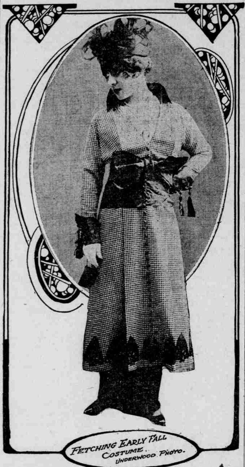
FETCHING EARLY FALL COSTUME.

As a hint for the early fall costume, a smart model is shown. The bodice and tunic are of checked material and the underskirt and high draped girde are of black satin.