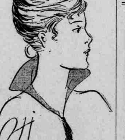
Fashionable Coiffure Is Merely a Series of Waves.