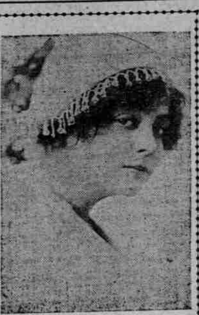
Trixie Friganza, Comedy Queen at the Orpheum.

THERE are bears and a "bear" at the Orpheum this week, but they don't mix worth a cent. In fact, when the stage manager hustled up to Trixie Friganza's dressing-room and personally admonished her "Please do not come out now, the other bears are coming on," Trixie Friganza, transfigured as quickly as a flash of Irish wit into Della O'Callahan, retorted: