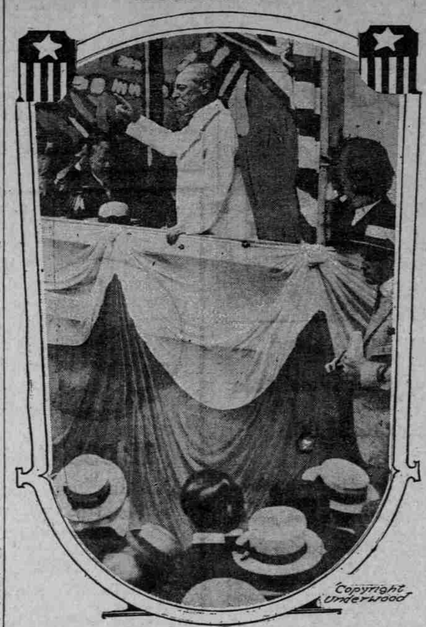
WOODROW WILSON, SPEAKING FROM BALCONY OF INDEPENDENCE HALL.