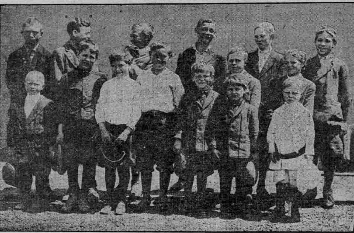
BOYS WHO WILL SAIL THIS MORNING FOR ILLWACO, WHERE MOST OF THEM WILL SEE THE OCEAN FOR THE FIRST TIME IN THEIR LIVES.