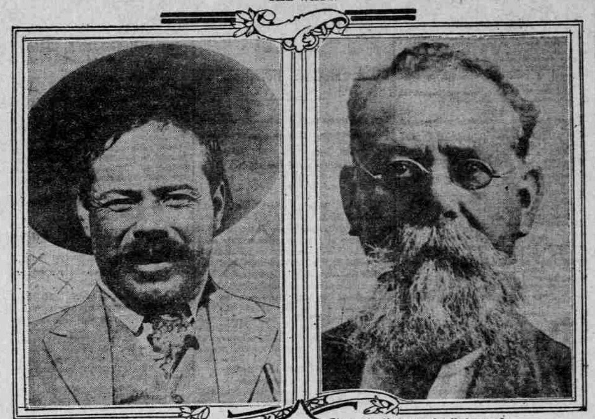
GENERAL FRANCISCO (PANCHE) VILLA.