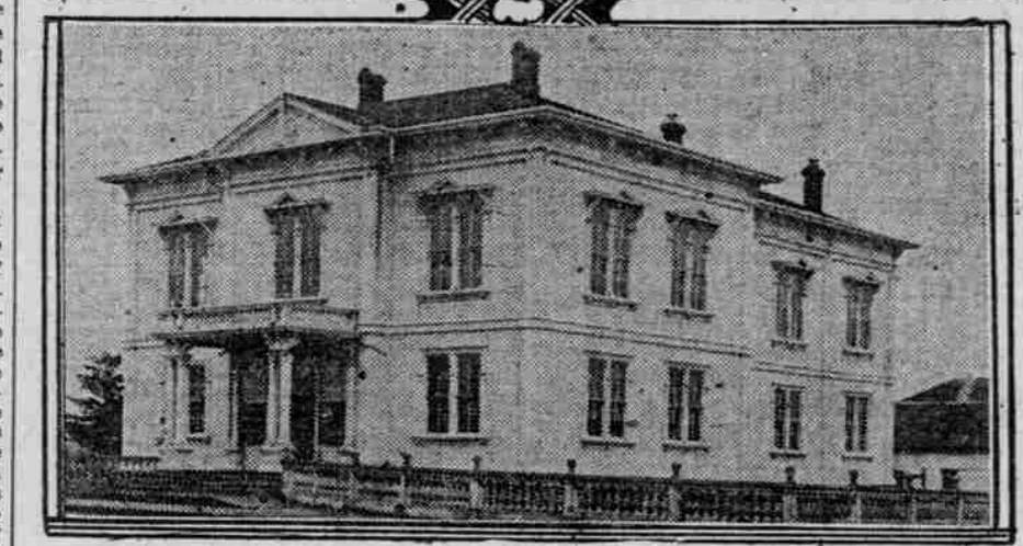
TOP, ONE OF THE BIG SAWMILLS-MIDDLE, VIEW OF LIGHTHOUSE. BOTTOM, COURTHOUSE.

It is about 18 miles as the crow flies, to the Oregon state line. The road up the coast takes one through the Smith River Valley proper G. Webb the River Valley proper G. Webb the