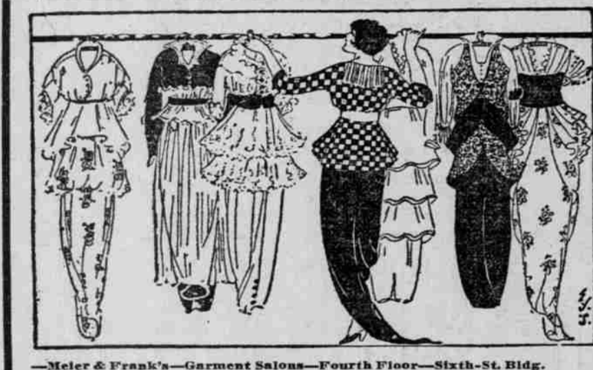
Meier & Frank's—Garment Salons—Fourth Floor—Sixth-St. Bldg.

Made in all the season's most desirable models—and shown in such favored colors as taupe, wistaria, lavender, greens, brown, black and navy.