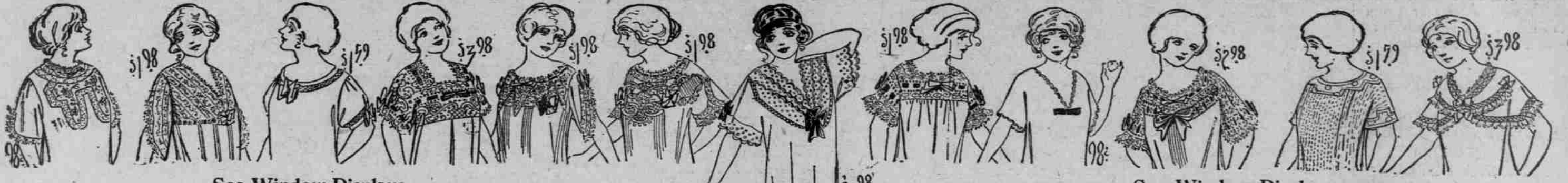
See Window Displays

Daintiest New Underclothing, Exquisite Laces and Embroideries Offered Now at Extremely Low Prices