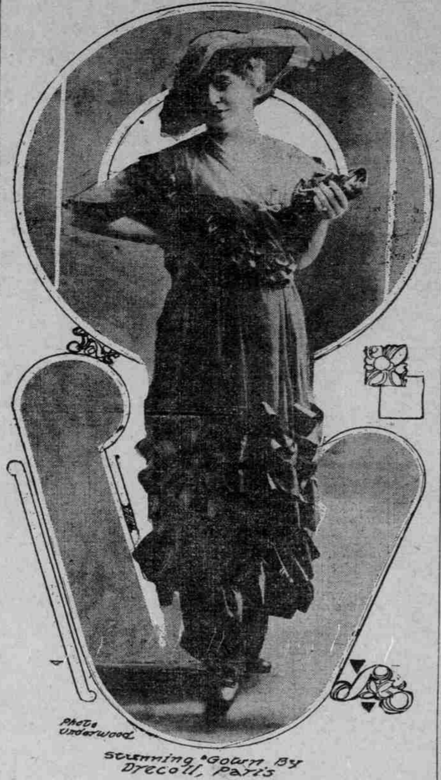
A stunning model designed by Drecol, of Paris, is one of the stunning models suitable for smart afternoon functions.

FRENCH CREATION OF TULLE IS TRIMMED WITH SATIN RUFFLES.