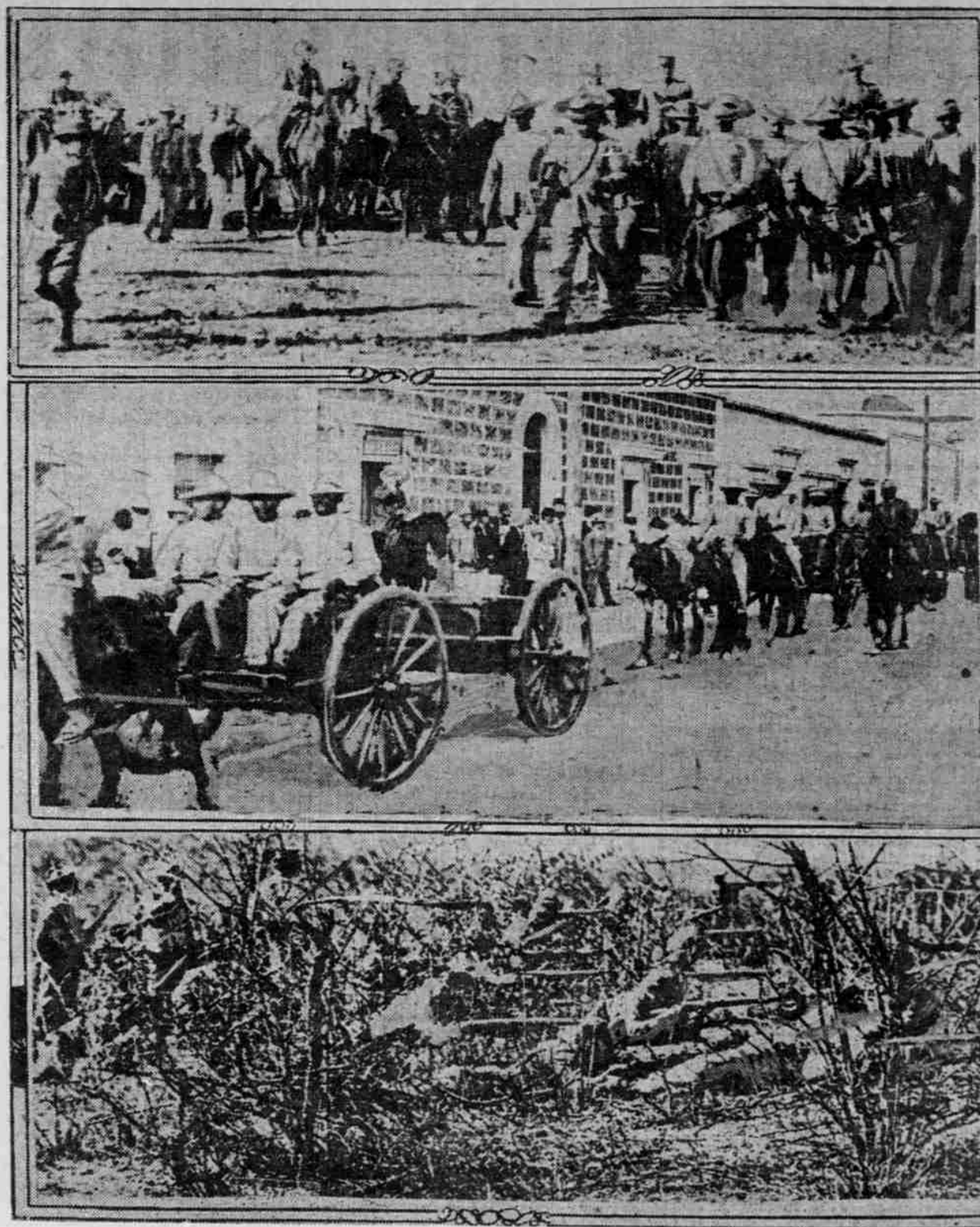
TOP—VILLA'S COLUMN ON WAY. MIDDLE—MARCH THROUGH TORREON AFTER LATE BATTLE. BELOW—SKIRMISHERS IN AMBUSH.

take horses and catch him. Then they take him back to stockade and wait until other men come in and then they beat this man with guns until they break his arm. Then he must work with one arm. We other men sit there like dead men. We are afraid. We do not help him."