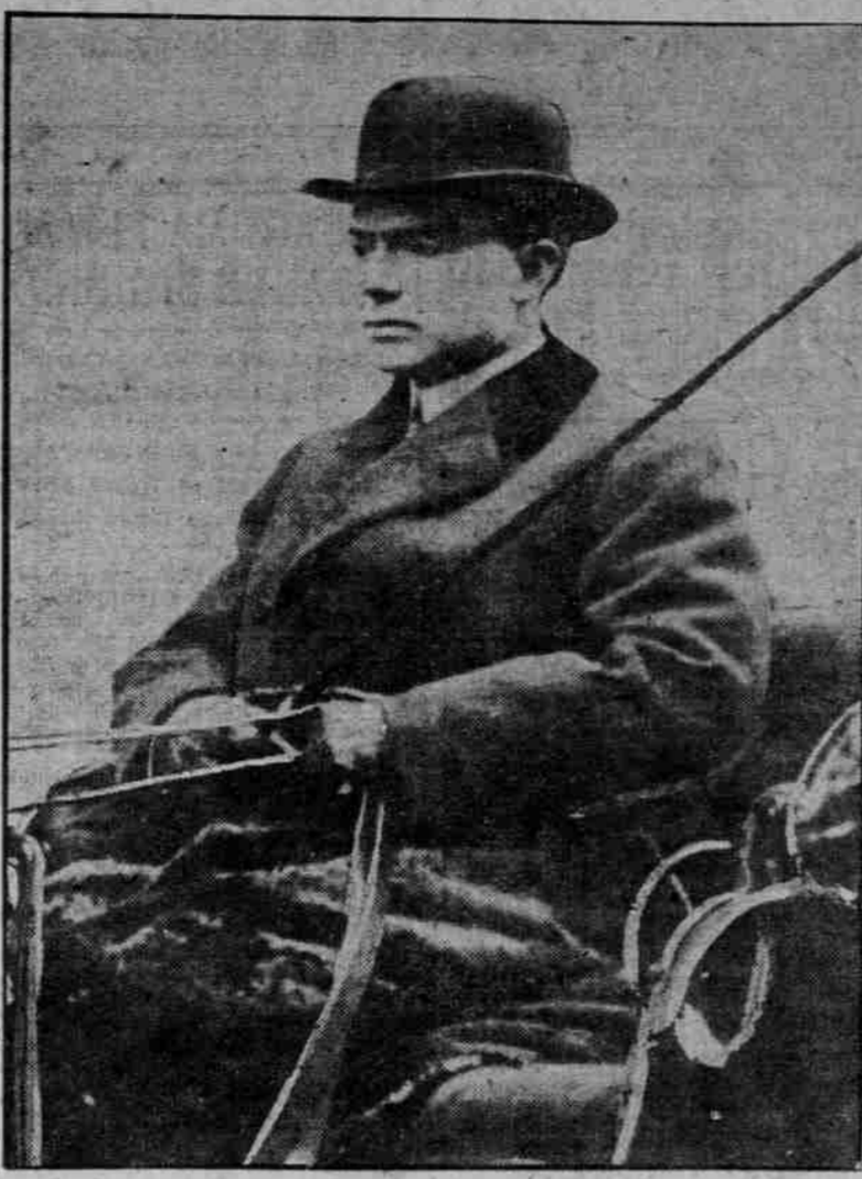
JOHN D. ROCKEFELLER, JR.