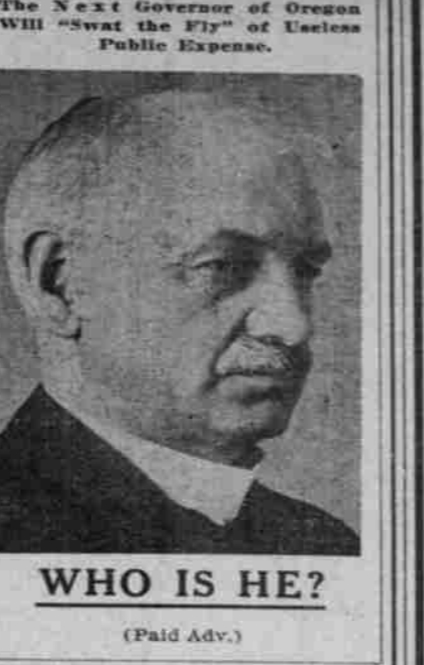
Who is he? (Paid Ad.)

Many other small girls are actively and successfully competing with boy enthusiasts in the work of trapping and "awtating."