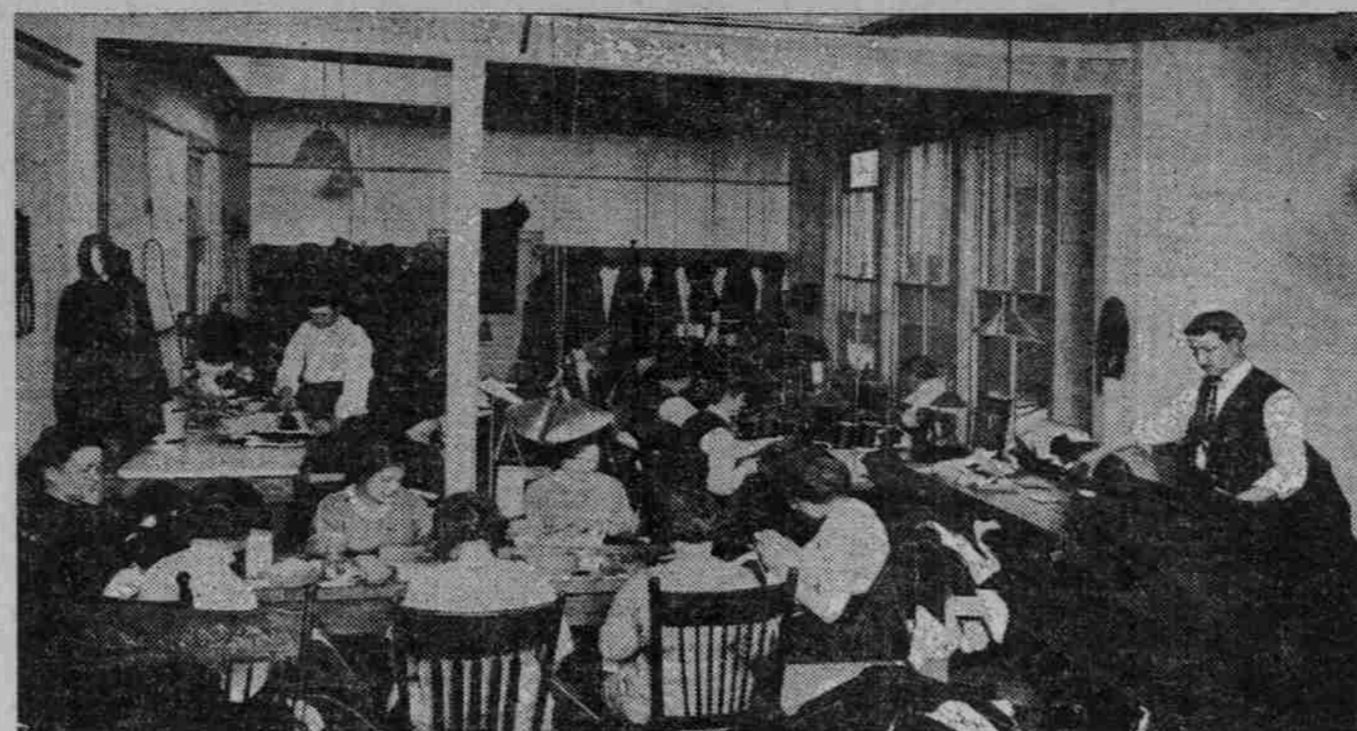
An Interior View of the First of the Shops Which Marks a New Era for Portland as a City of Payrolls.