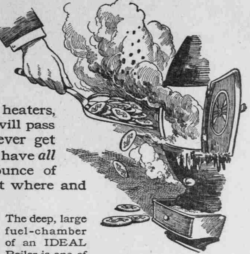
The deep, large fuel-chamber of an IDEAL Boiler is one of the strong features for producing fuel savings—it offers best conditions for extracting heat.

A deep, slow fire is easily proven best as compared with the shallow firepots of old-fashioned heating methods—just as a big cake of ice which fills the refrigerator box gives far steadier, more economical results than you get from frequently throwing in a handful of cracked ice. The big IDEAL fire-chamber extracts full value of your coal!