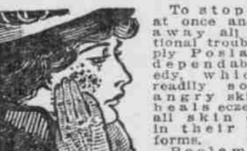
To stop itching and once and drive away all eruptions, apply Poslam, the dependable remedy which is readily absorbed, soothes an angry skin and breaks a scabies and all skin diseases in their virulent forms. Poslam brings immediate relief and comfort. You can observe the progress of healing day by day. The eradication of pimples and other blemishes is but a matter of the briefest treatment.

have produced the grandest remedy for woman's ills that the world has ever known. From the roots and herbs of the field Lydia E. Pinkham, more than thirty years ago, gave to womankind a remedy for their peculiar ills which has proved more efficacious than any other combination of drugs ever compounded, and today Lydia E. Pinkham's Vegetable Compound is recognized from coast to coast as the standard remedy for woman's ills.—Adv.