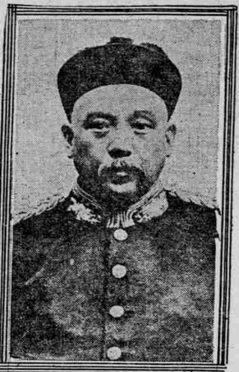
Sun Yat Sen, Vice-President of China.