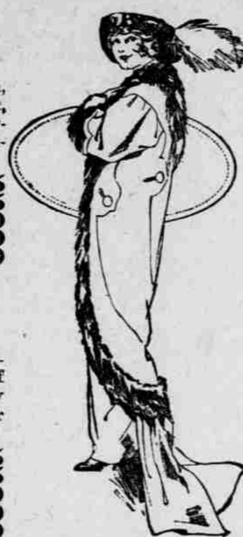
—Meier & Frank's—Garment Salons—Second Floor, Main Bldg.