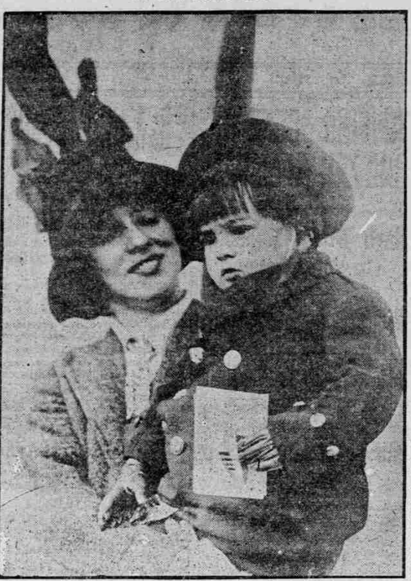
EVELYN NESBIT THAW AND OFFSPRING.