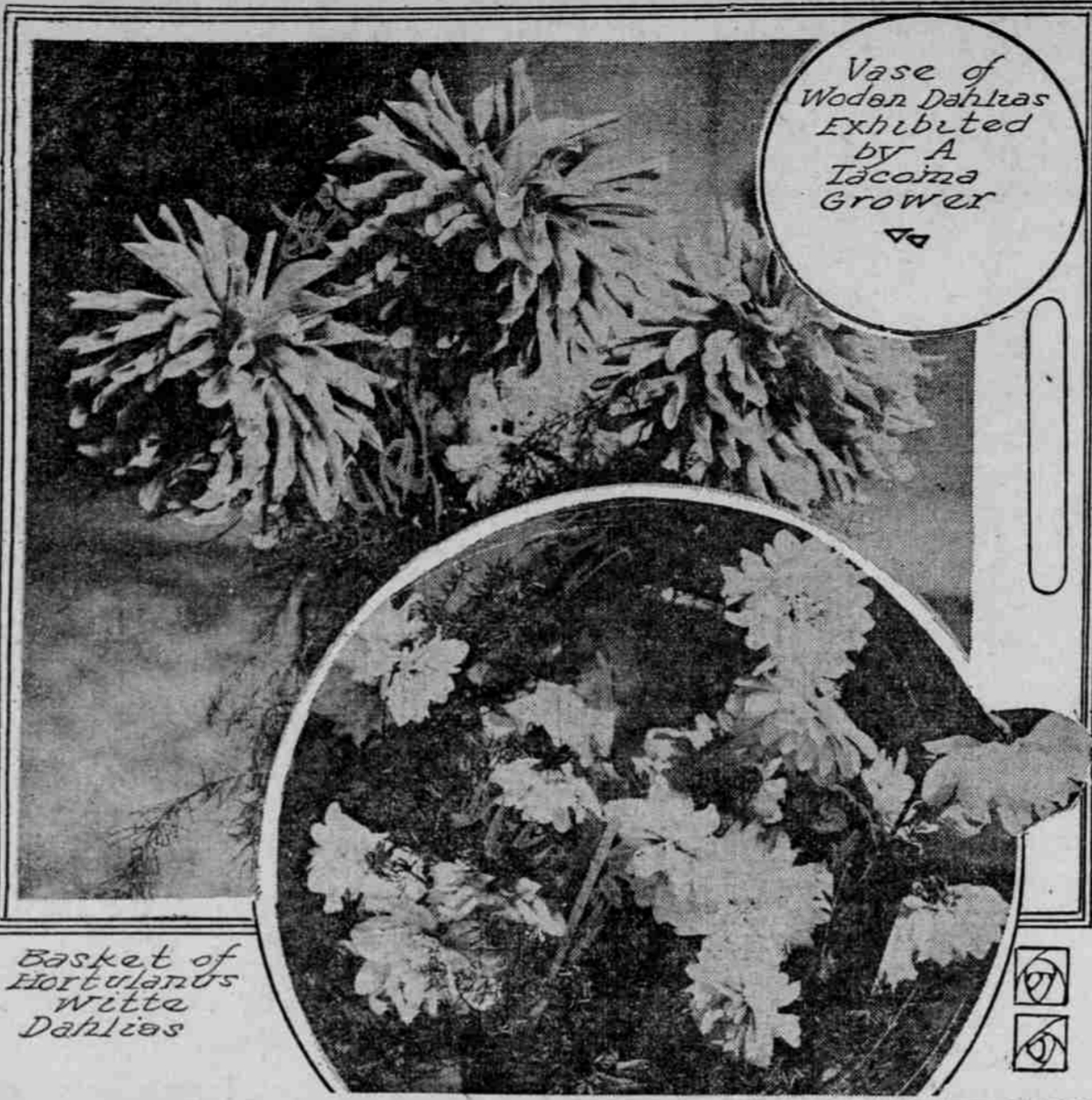
Vase of Wodan Dahlias Exhibited by A. Tacoma Grower