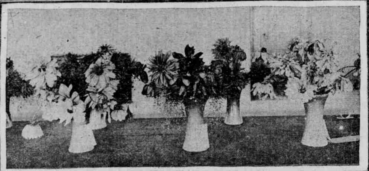
PRIZE DAHLIAS IN VASES ATTRACTED ATTENTION.