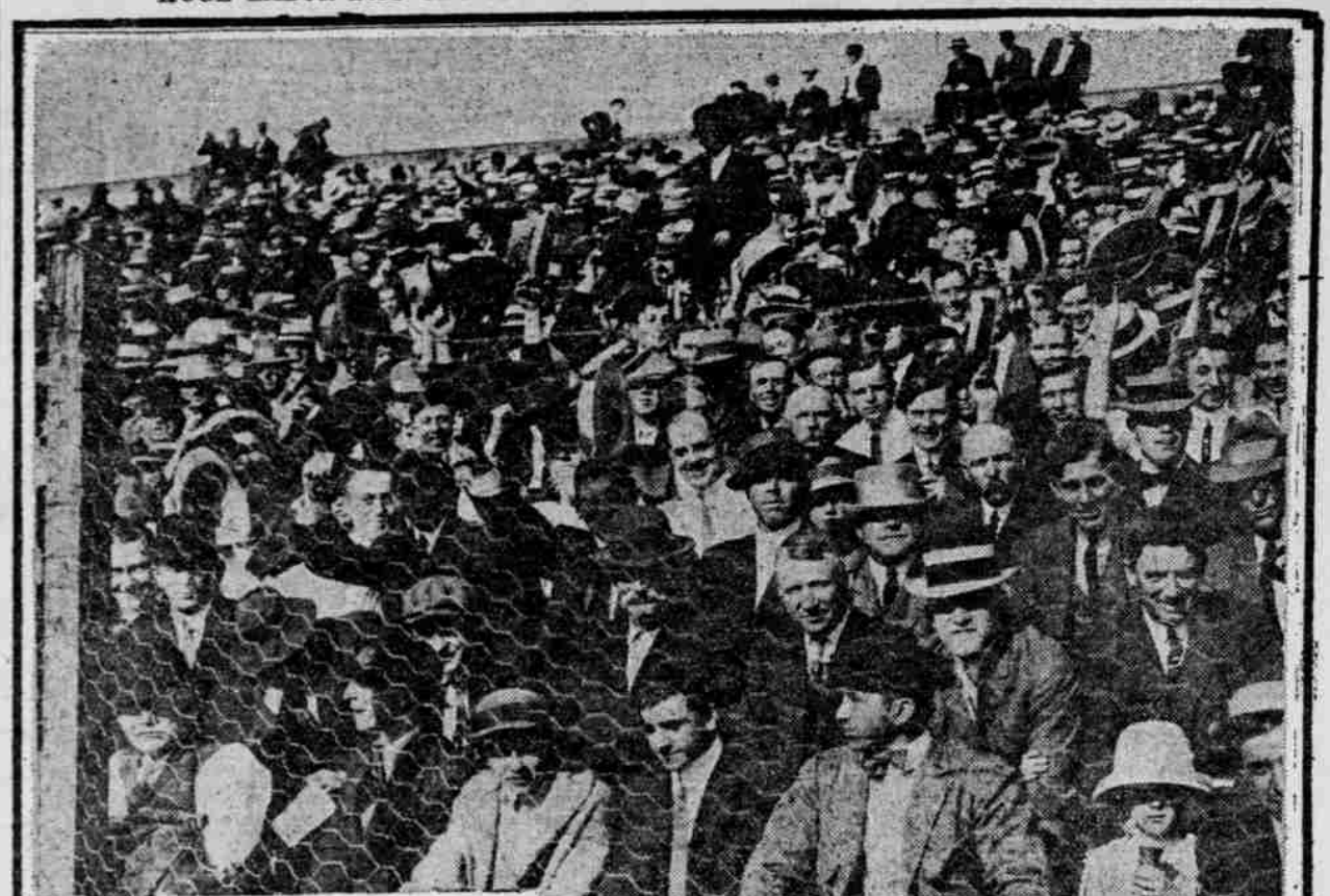
Slant at The Bleachers Crowd.