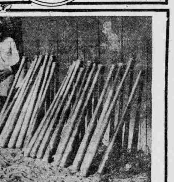
Bats, stacked Against Stand, Fans—Breakers Boys Wolverton.