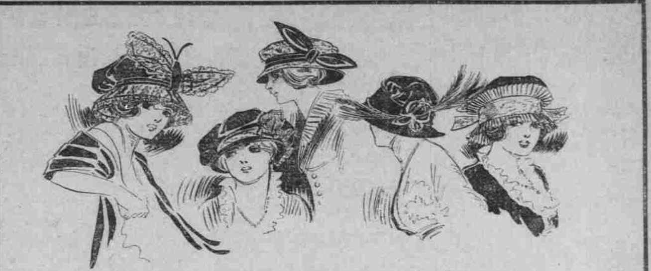
Hats Were Drawn From Models on Sale

SEATTLE, Wash., Aug. 6.—A severe earthquake, 2000 miles from Seattle, beginning at 1:23 o'clock this afternoon and continuing until 4 P. M. was recorded on the seismograph at the University of Washington today. The most severe shock was recorded at 2 o'clock. The center of the disturbance was computed at 2000 miles northwest of Seattle.