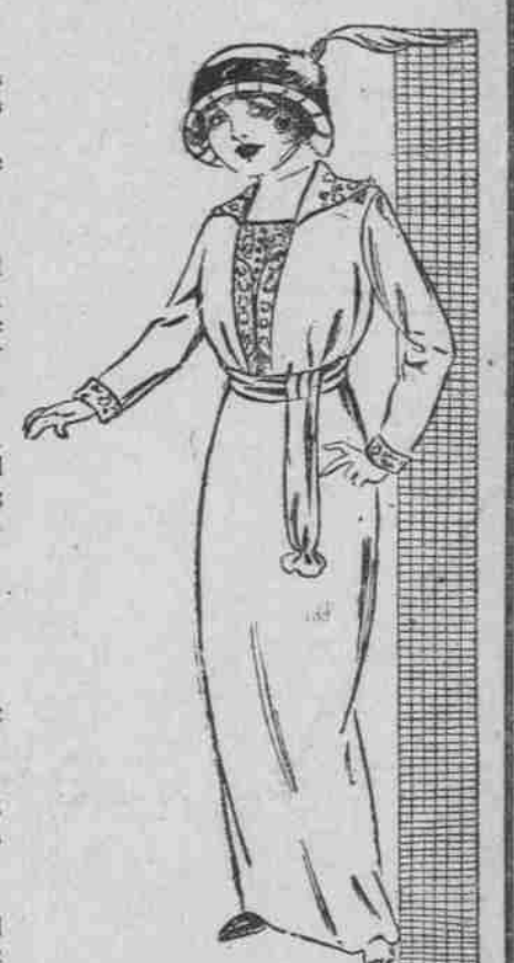
Why Not Buy A Dress at $6.45?

Now On Sale Here Butterick's Sept. Patterns and Style Book