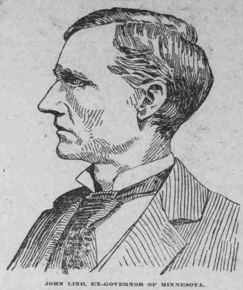
JOHN LIND, EX-GOVERNOR OF MINNESOTA.