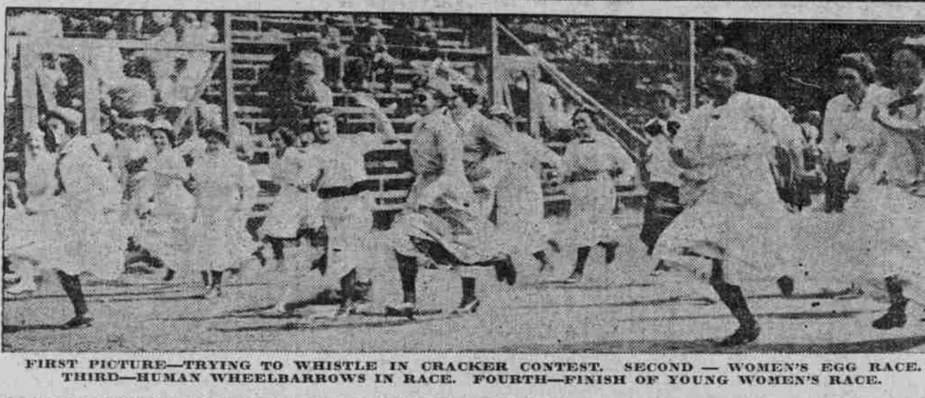
FIRST PICTURE—TRYING TO WHISTLE IN CRACKER CONTEST. SECOND—WOMEN'S EGG RACE. THIRD—HUMAN WHEELBARROWS IN RACE. FOURTH—FINISH OF YOUNG WOMEN'S RACE.