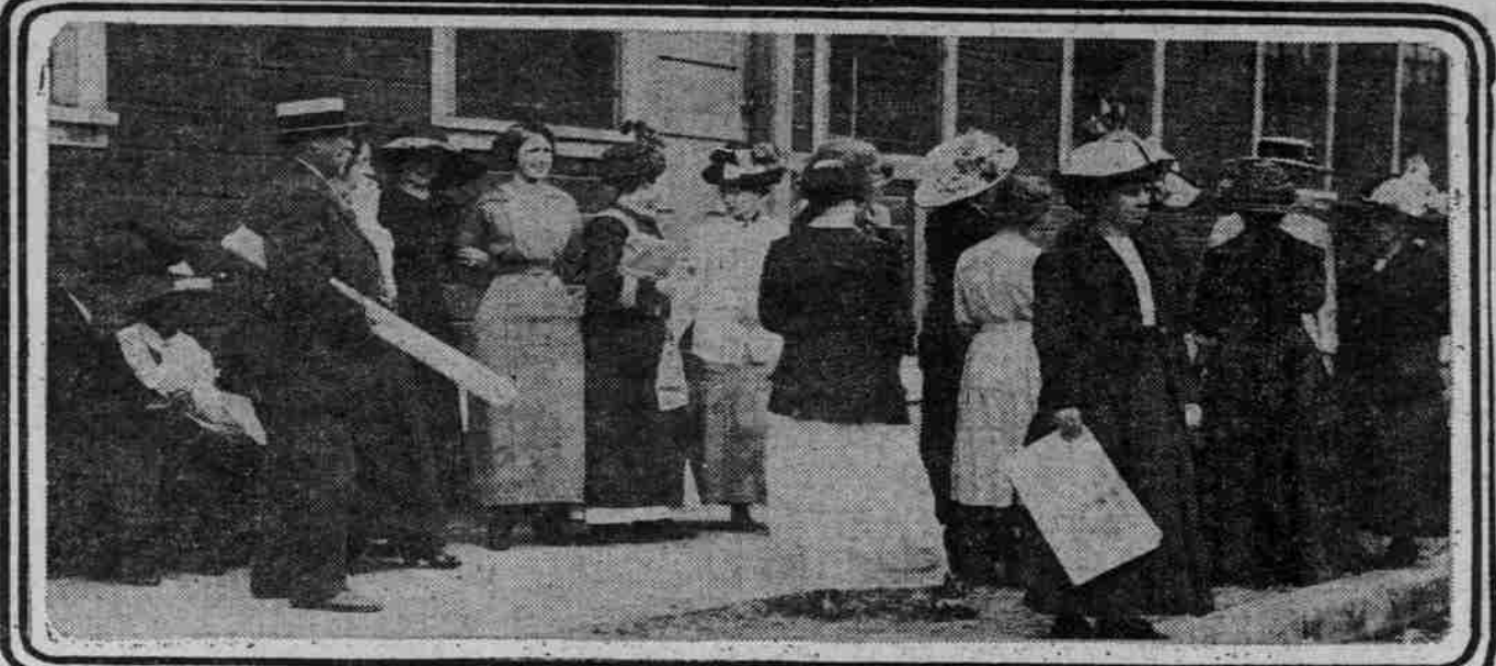
Girl Workers in Front of Cannery