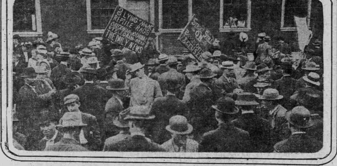
Agitators and spectators gathered in Street