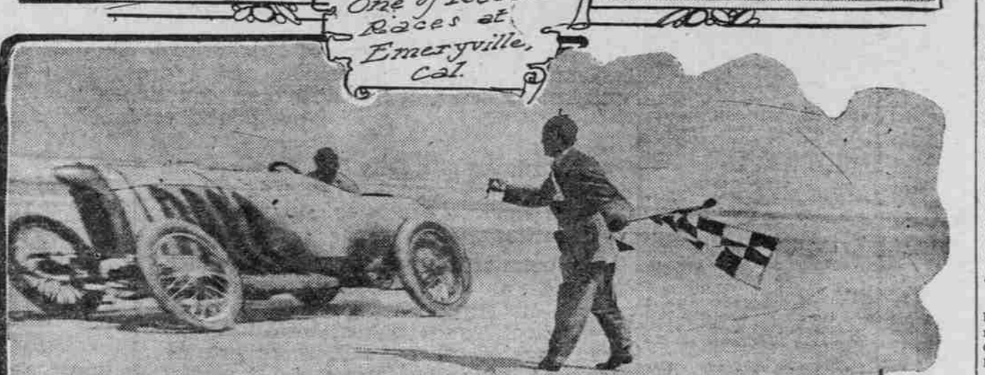
One of Recent Races at Emeryville, Cal. Doing His Recent Mile in 25 1/2 Seconds.