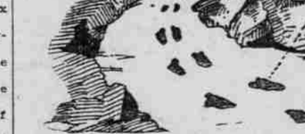
The Old Enemy in the Blood is Driven Back to Oblivion by S. S. S.

Averted by Great Remedy. We are Daily Subjected to Many Perils in Bruises, Contusions, Insect Bites, Poison Ivy and Toxic Minerals