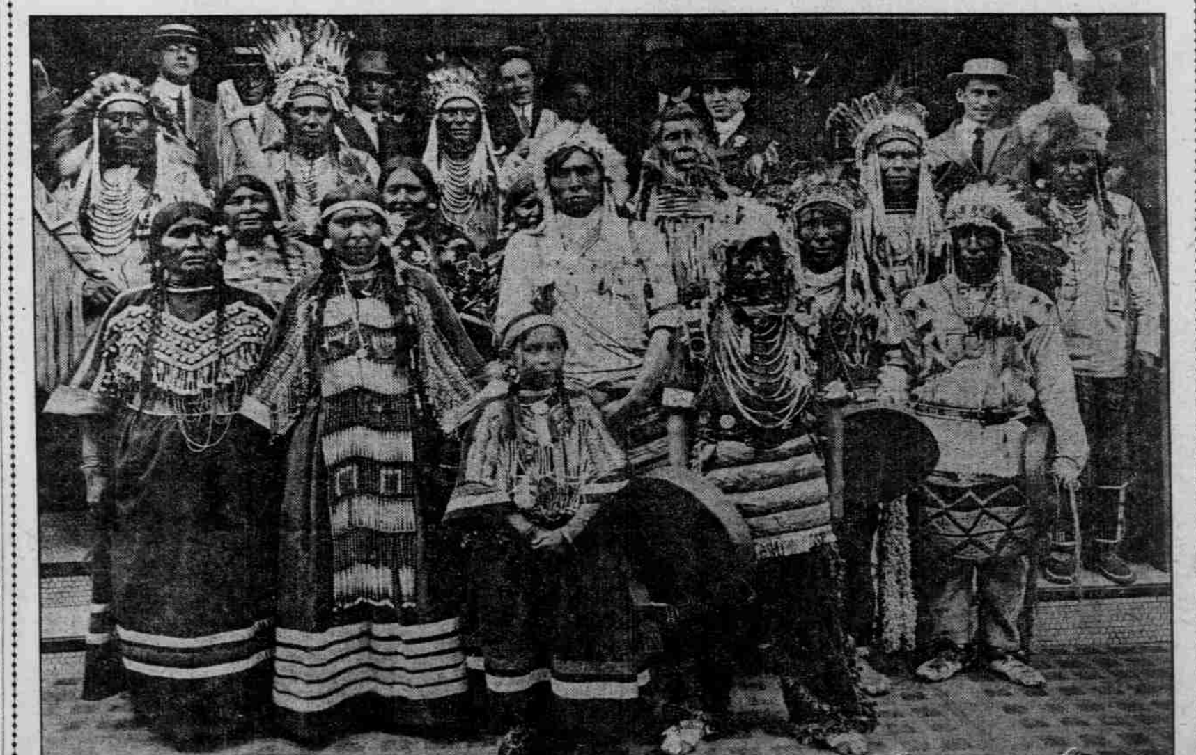
PARTY OF 16 BROUGHT FROM GLACIER NATIONAL PARK AS GUESTS OF PORTLAND PRESS CLUB.