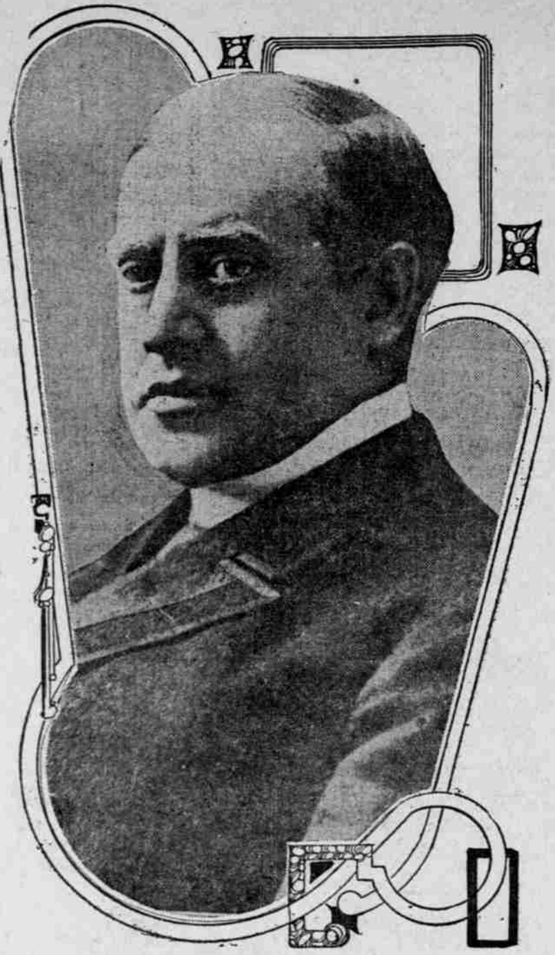
NAT C. GOODWIN.

NOTED ACTOR WHO WILL BE SEEN AT THE HELIG TONIGHT.