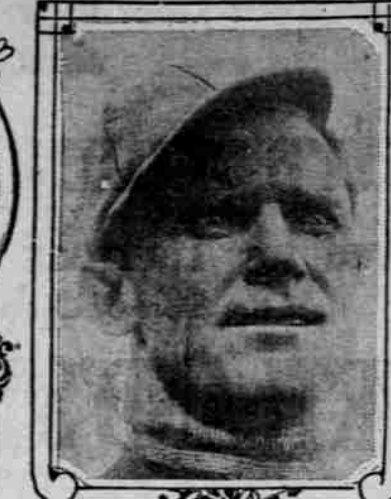
Charles Dooin Philadelphia