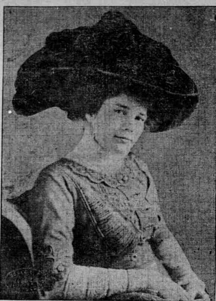
MRS. ETHEL ROOSEVELT DERBY.