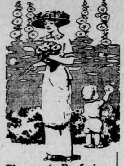
Flowers in Profusion on Many New Hats

shown in our Second Floor Millinery Parlors. Then, too, you'll find trimmings of dainty stick-ups. On the popular Question-Mark Hats, feather trimmings are used in pleasing effects, and Bulgarian ribbons find great favor in designing. You'll find a charming array of beautiful Spring Hats here at