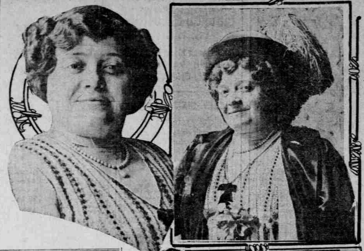
MARY GARDEN ASTONISHES AND ELECTRIFIES AUDIENCE.