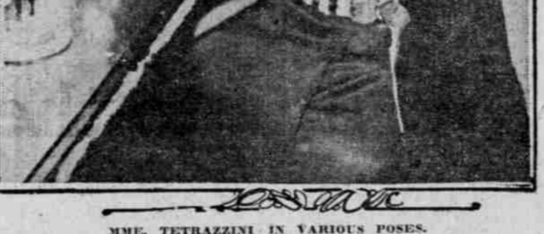
MME. TETRAZZINI IN VARIOUS POSES.