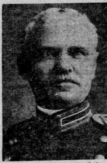
Colonel George W. Goethals.