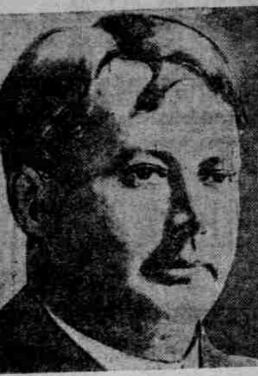
Albert S. Burleson.