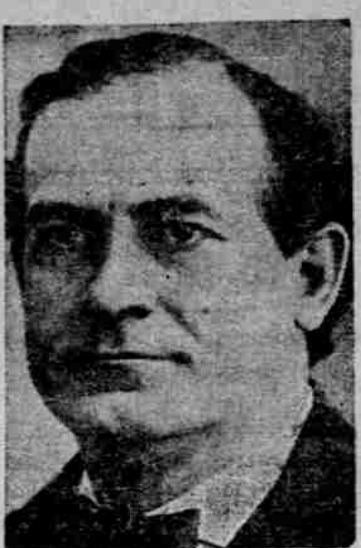
William J. Bryan.