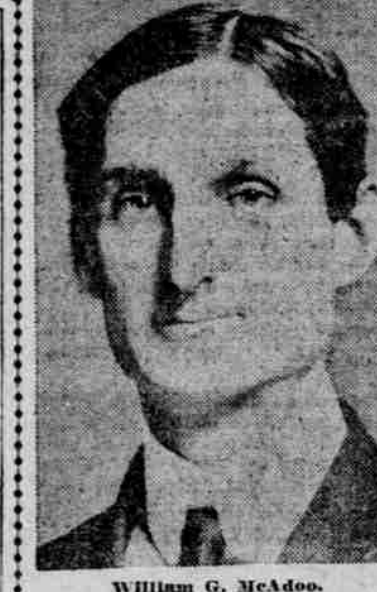
William G. McAdoo.

Josephus Daniels and William G. McAdoo to Join Circle, as Secretaries of Navy and Treasury, Respectively.