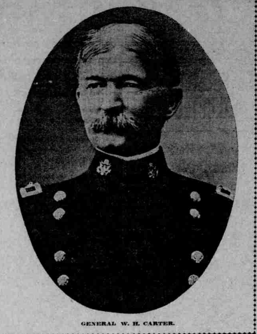
GENERAL W. H. CARTER.