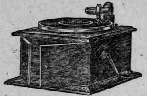
Victor-Victrola IV, $15 Oak