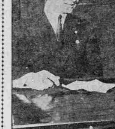
Frank Chance, New Manager, at the Left, and Frank Farrell, Owner, at the Right, Signed a Contract...

THE TWO FRANKS OF THE NEW YORK AMERICANS SIGNING MANAGERIAL PAPERS.