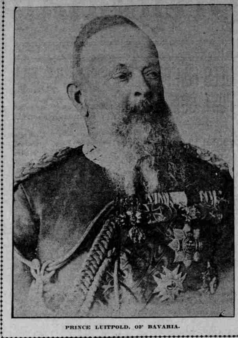
PRINCE LUITPOLD, OF BAVARIA.