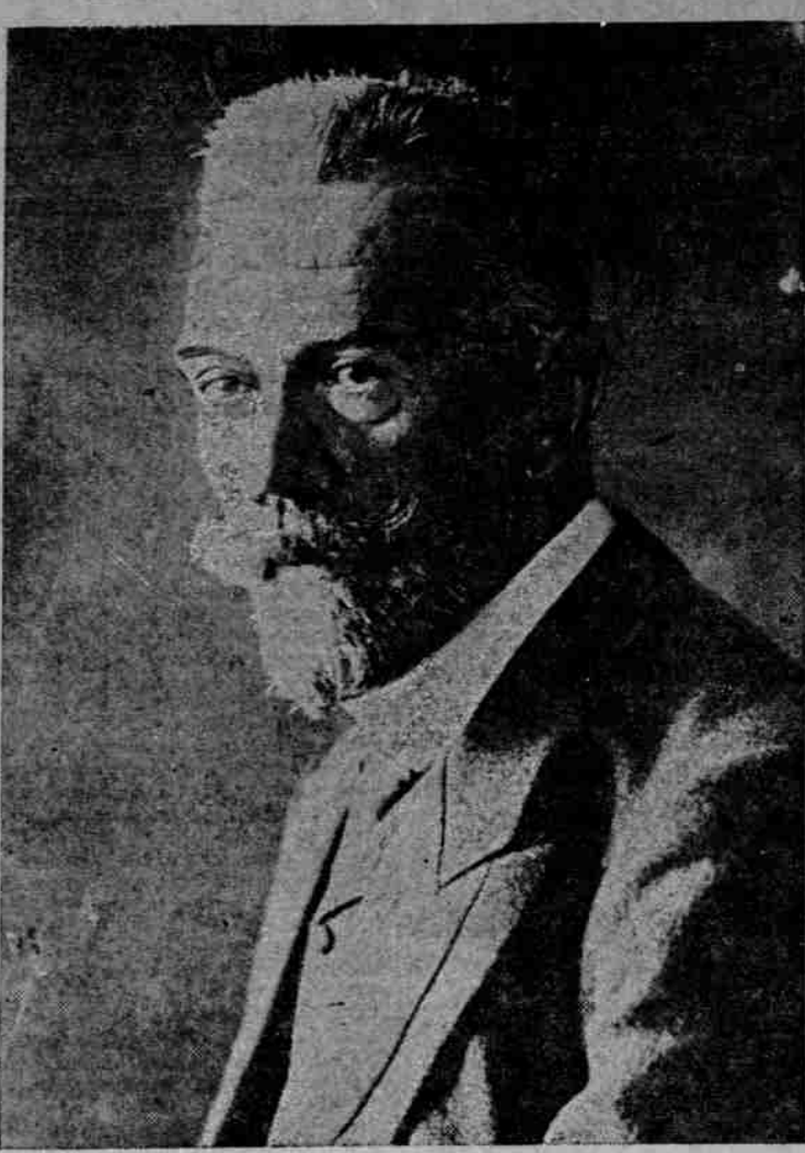
DR. VON BETHMANN HOLLWEG.