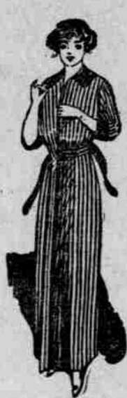
NEW COMBINATION OR DOUBLE SERVICE DRESS Special $1.35

—Here's the biggest showing of house dresses, kimonos and aprons that has been seen for many a day. Tuesday we are going to give you practical house garments at unheard-of low prices. If you haven't a house dress, get one now—if you haven't a number of work aprons, supply your needs now. —our prices unsurpassed. More women learn each day that time and money can be saved by purchasing these useful garments here. These dresses and aprons are made especially for us—from high-grade materials—and finished throughout in the best possible manner. All sizes—all colorings.