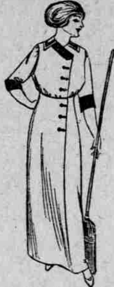
ONE-PIECE HOUSE DRESS Selling Regularly at $1.75 Special $1.35

—Made of nurses' stripe gingham with square cut neck, pleats on shoulders, short sleeves, plain colored chambray banding finishing neck and side opening of waist and skirt.