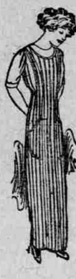
The New Combination House Dress and Apron Special $1.15

The Savings to Be Made in These Popular Garments will Bring Many to this Sale