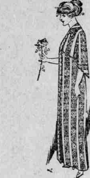
FLANNELETTE KIMONOS Selling Regularly at $2.00 Special $1.35

—A well-fitted apron made with bib and straps over shoulder, neatly bound edges. Of light figured, dotted and striped percales and dark shepherd checks, indigo blue with white dots.