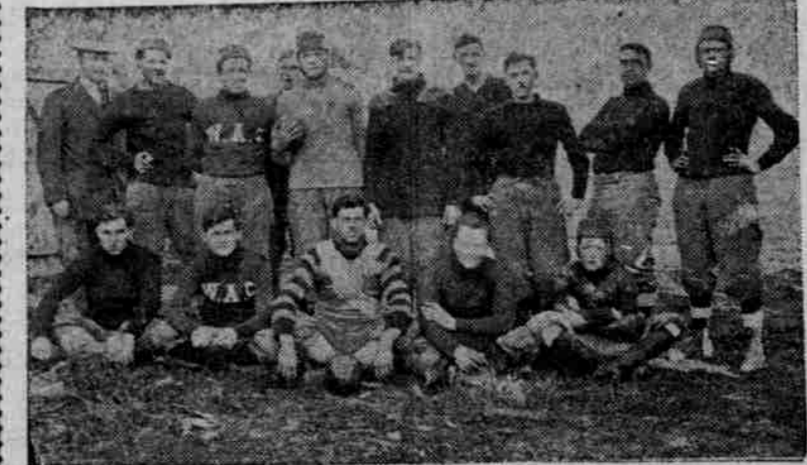
WOODBURN ATHLETIC CLUB TEAM. WOODBURN, Or., Nov. 23.—(Special.)—The Woodburn Athletic Club football team will play the Piedmont team of Portland here on Thanksgiving day. It is expected that this game will end the season for the Athletics.