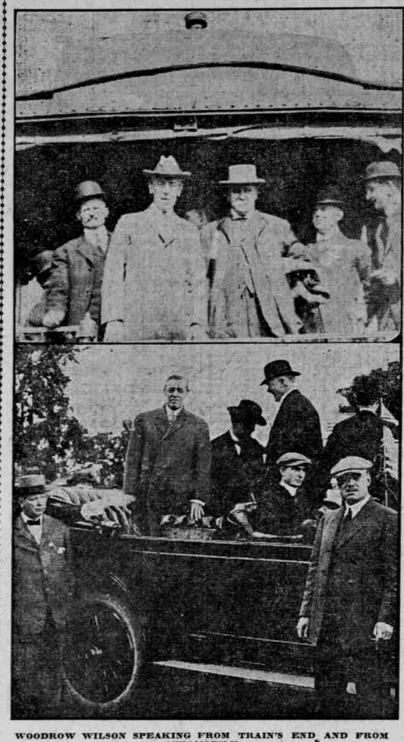
WOODROW WILSON SPEAKING FROM TRAIN'S END AND FROM AUTOMOBILE.

CAMPAIGN SNAPSHOTS OF DEMOCRATIC NOMINEE, WHO IS ABOUT TO RESUME TOUR.