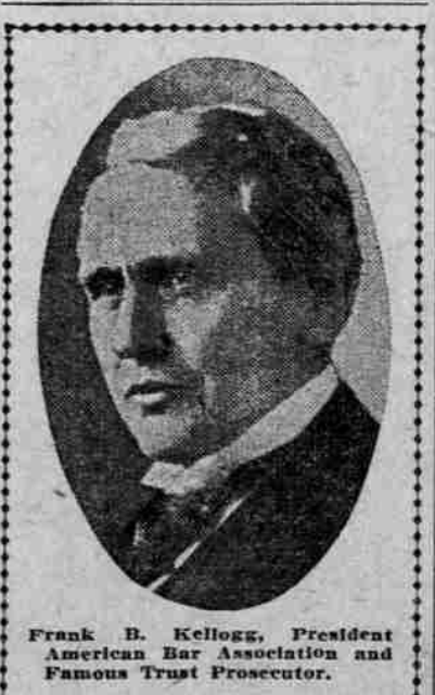
Frank B. Kellogg, President American Bar Association and Famous Trust Prosecutor.

City's Prosperity Interests. "It is a matter of great surprise to me to find such a beautiful, modern