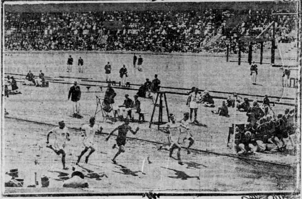
Sensational Finish of the 100 Meters Race.