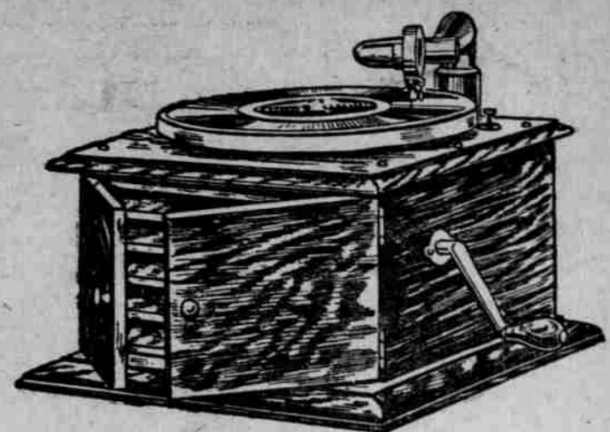
Victor-Victrola IV, $15

This instrument is a genuine Victor-Victrola, of the same high quality which characterizes all products of the Victor Company, and is equipped with all the exclusive Victrola patented features.